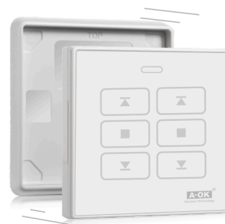
Magnet wall holder